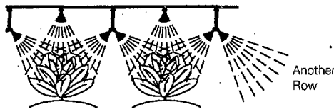
Application Following Transplanting up to 3 Weeks