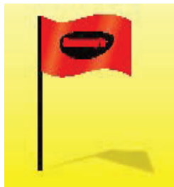
[ # ] [Active Tunnel] Locator Flags