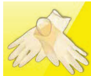
[ # ] Pair of Gloves