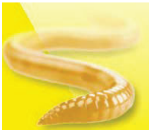
[ # ] [Moleworms] [Worms]