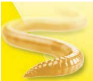
[ # ] [Moleworms] [Worms]