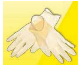
[ # ] Pair of Gloves

[ The terms "this product " or "the product" may be used in place of the product name throughout label text.] [ Brackets indicate optional language or master label reader's notes]