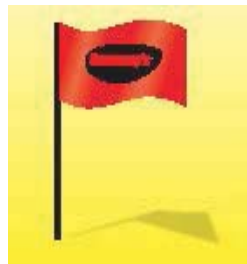
[ # ] [Active Tunnel] Locator Flags