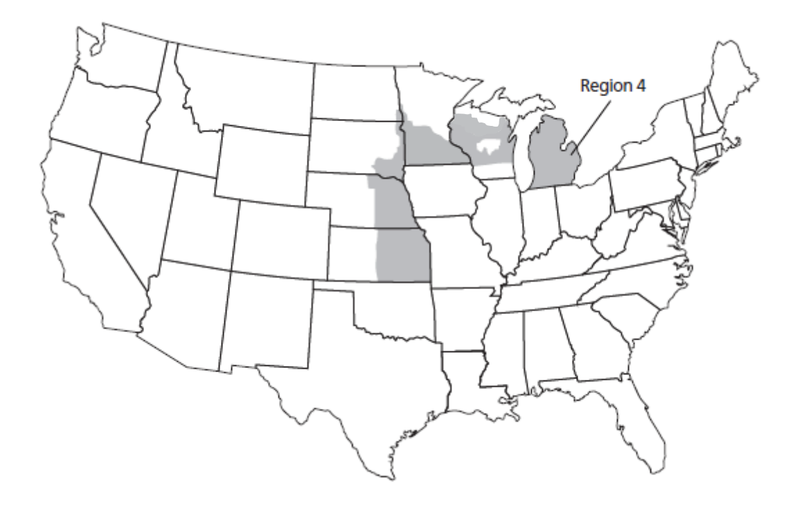
REGION 4 (Maximum Rate 1 pt/A, alternate years)