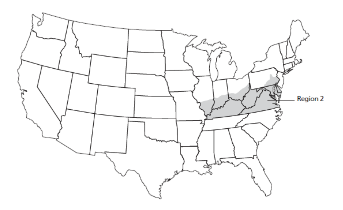
REGION 2 (Maximum Rate 1.6 pt/A, alternate years)