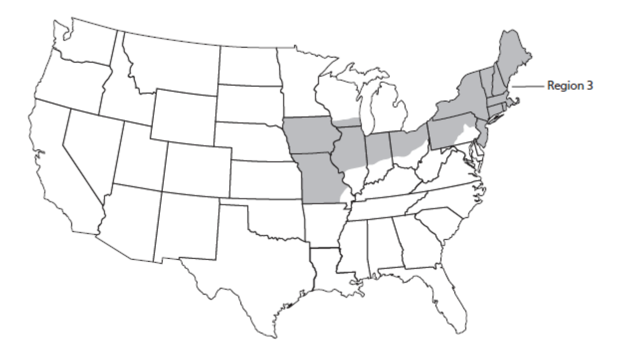
REGION 3 (Maximum Rate 1.3 pt/A, alternate years)