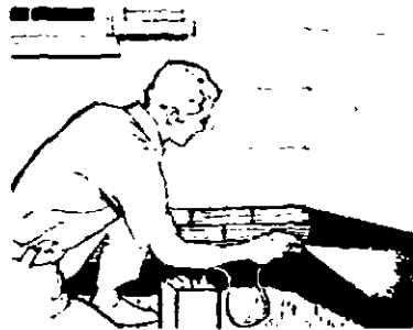
Around house foundations