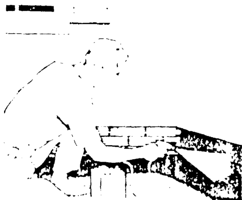
Around house foundations