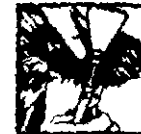
FIGURE 4 Apply through ear between second and third ribs, halfway between ear tip and head.

For optimum control and to minimize development of insect resistance, use two tags per animal (one in each ear). All animals in the herd should be tagged. Apply when flies first appear in spring. Replace as necessary. Apply with Airflex ® Tagging System. Tags remain effective up to 5 months. Remove tags in fall.