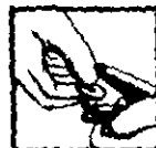
FIGURE 1 Place male button onto pin until it projects through the top.

It is a violation of Federal law to use this product in a manner inconsistent with its labeling. This labeling must be in the possession of the user at the time of pesticide application.