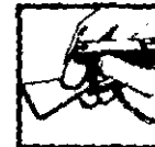
FIGURE 3 Press female tag under the clip by depressing lever.