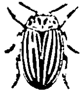
Colorado Potato Beetle