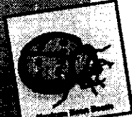
Mexican Bean Beetle