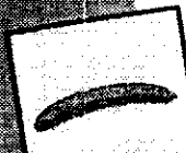
Imported Cabbage Worm