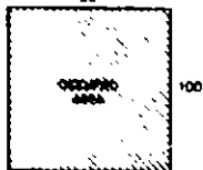
DURING PERIODS OF STILL AIR TREAT SHADED AREA 100