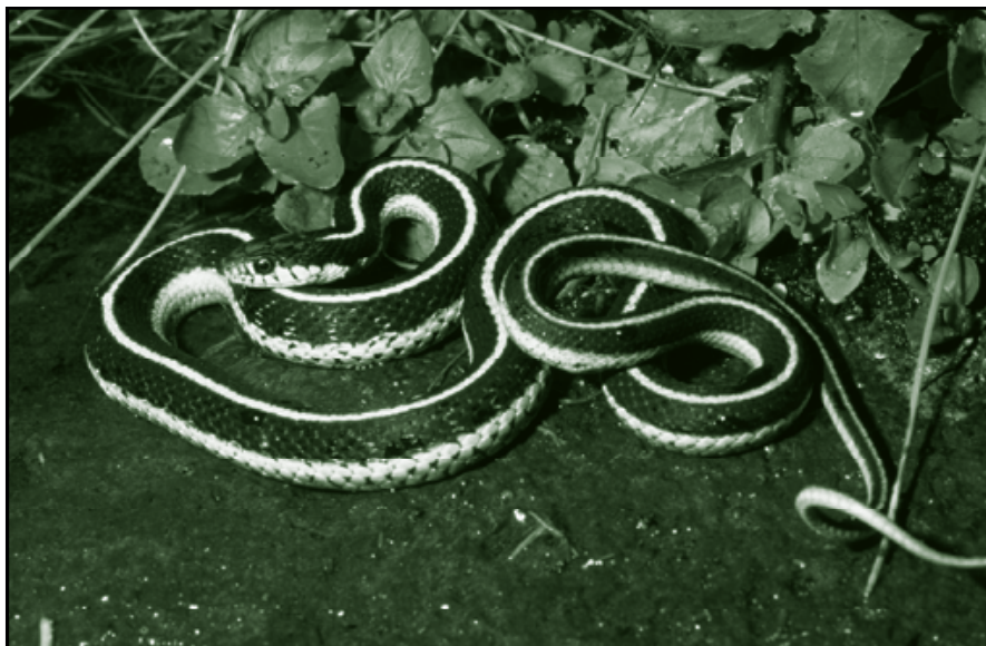
Garter Snake ( Thamnophis elegans ) - When disturbed, garter snakes will release an unpleasant smelling musk from glands located at the base of their tail.

Vernal pools, one type of ephemeral wetland, are of critical importance to amphibian populations. As small, often isolated wetlands, vernal pools are only wet for a portion of the year. Periodic drying creates a fish-free environment for amphibians, many of which have adapted rapid egg and larval stages as a race against the dry season. The absence of fish predators in vernal pools benefits amphibian populations.