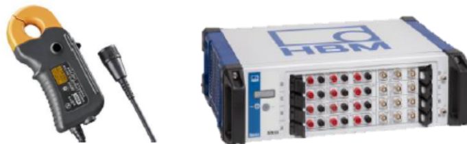
Above: Hioki CT684X-05 current clamp and HBM Gen4TB power analyzer

AC Level 2 240 V/ 48 A (11.5 kW) charger was used for charging.