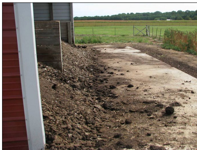
Photo 9. This storage structure may have inadequate capacity for the amount of litter being stored. The area around the storage shed drains to a water of the U.S. and does not have any runoff controls.