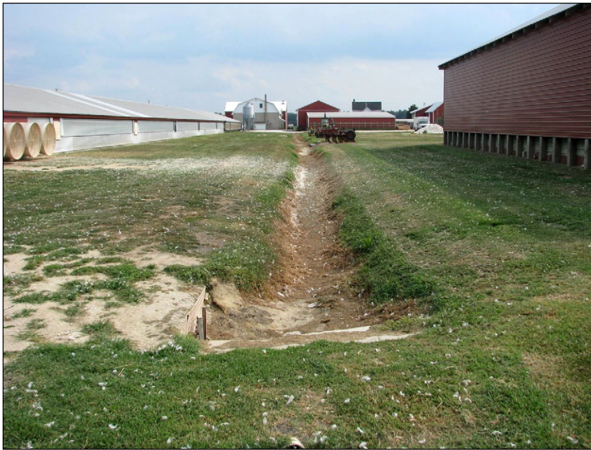
Photo 10. The photo shows a poultry operation that was designed to have precipitation drain away from houses through a conveyance system that discharges to a water of the U.S. If pollutants will be carried by this conveyance system to waters of the U.S., the facility is proposing to discharge.

See the text box on page 14 for other design, construction, operation, and maintenance factors specific to poultry operations.