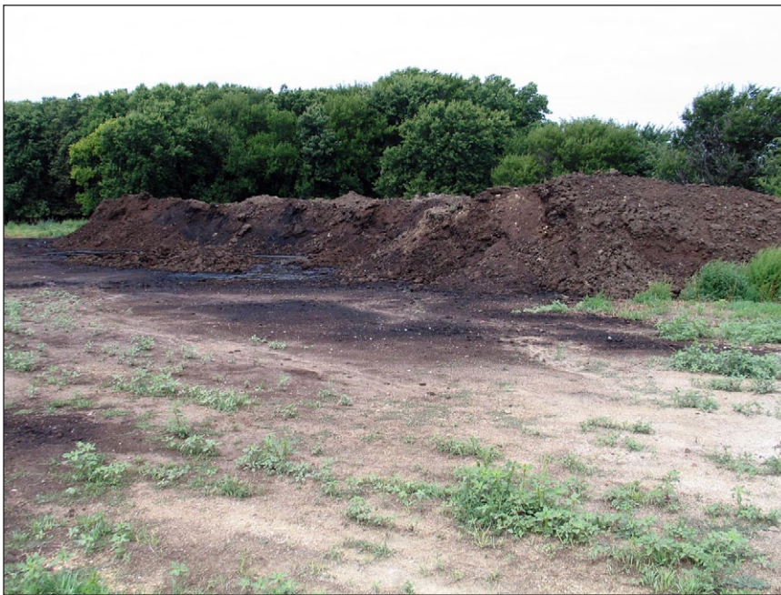
Photo 1. This stockpile is up to eight feet tall and sixty feet long without cover or containment. A creek runs through the wooded area behind the pile. Any runoff from the stockpile to waters of the U.S. would be a discharge from the CAFO.

Waste storage and handling practices differ depending on whether the CAFO's waste handling system is dry, liquid, or a combination of the two. For dry manure handling systems, it is important to consider