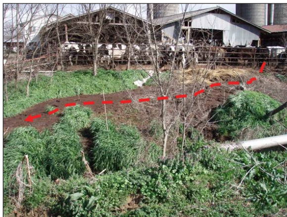
Photo 5. The dairy CAFO pictured above has had discharges from the confinement area bypassing the waste containment storage structure (denoted by red dashed line).

Dairy operations have design and construction considerations that are relevant to the determination of whether the CAFO discharges or proposes to discharge. For example, a dairy operation constructed with floor drains or catch basins that outlet to a surface water is a CAFO that discharges. Therefore, it is important to consider whether a dairy directs waste streams from barns to a proper containment structure or if waste is managed in a manner causing it to be discharged from the barns, including the milking parlor, through a conveyance to a water of the U.S. Additionally, dairies should consider whether all process-generated wastewater is contained, including wastewater from commodity barns and silage bunkers and from portions of the production area that are uncovered, such as feed storage areas, animal pens and loafing areas. See photo 5.