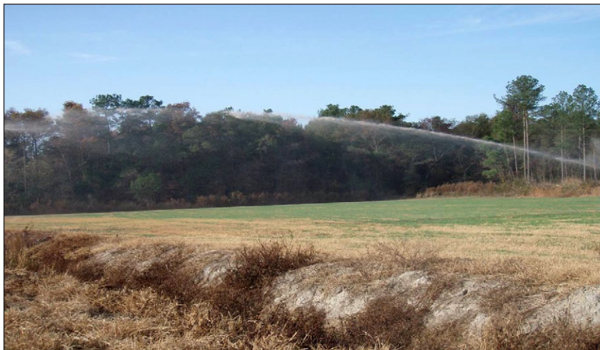
Photo 4. This CAFO is discharging during dry weather by spraying manure/wastewater into a ditch that flows to a water of the U.S. In addition, inadequate edge-of-field conservation practices may be insufficient to control runoff (see § 122.42(e)(1)(vi)), to the extent necessary to qualify as agricultural stormwater discharges (see § 122.23(e)).

Recordkeeping for Land Application Area(s). For discharges from CAFO land application areas to qualify for the agricultural stormwater exemption the CAFO must maintain records in accordance with 40 CFR 122.42(e)(1)(ix). (Also see §122.23(e).) Written records of application amounts, timing, crop nutrient needs, soil and manure testing, conservation practices and other important factors are essential for an assessment of whether there are point source discharges from a CAFO's land application areas. Typical documentation of how a CAFO implements in-field and edge-of-field conservation practices could include records related to maintenance of terraces, vegetated buffers, riparian buffers or other practices.