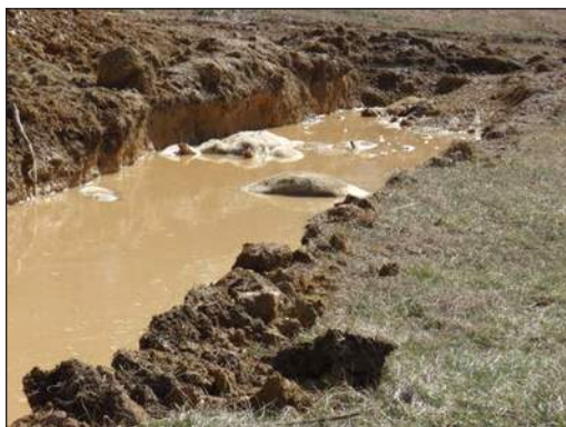
Photo 3. This CAFO is discharging by disposing of mortalities in a conveyance that drains to a water of the U.S.

The CAFO's production area also includes "any area used in the storage, handling, treatment, or disposal of mortalities." 40 CFR 122.23(b)(8). Relevant factors to consider in assessing whether the CAFO discharges or proposes to discharge in connection with mortality management include the type(s) of animal(s) maintained at the operation, methods for handling and disposal of animal mortalities, state and local laws, mortality rate, storage capabilities and other site specific factors. For example, if a CAFO relies on a rendering facility to pick up carcasses, the CAFO owner or operator should consider whether the CAFO has adequate storage to accommodate all mortalities between pick-ups and whether the storage