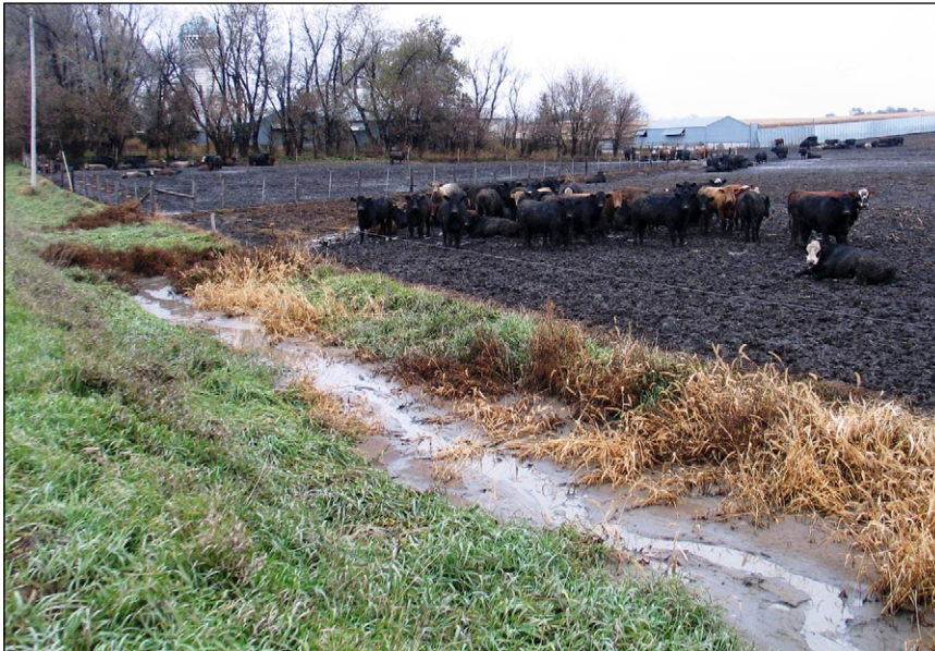
Photo 7. This section of the beef feedlot production area has an outlet for manure and process wastewater to a roadside ditch. If the ditch is, or conveys process wastewater to, a water of the U.S., then the CAFO discharges or proposes to discharge.

determining whether a beef cattle operation discharges or proposes to discharge, an important consideration is if the feedlot has sufficient containment for all manure, wastewater and direct precipitation for the minimum critical storage period. Because the animals and manure are typically not housed under roof at beef cattle operations it is particularly important to consider climate and proximity to waters of the U.S. when evaluating whether beef cattle operations propose to discharge, as well as the design of the animal pens, which at some operations are sloped to drain to waters of U.S.