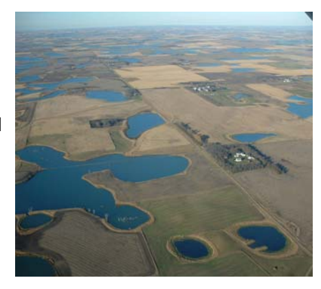
The Prairie Pothole region in North and South Dakota.

Additionally, the recent pine beetle outbreak in the Rocky2 Mountains has altered the hydrological functioning of these2 ecosystems by influencing snow distribution and snowmelt in2 complex ways. Other considerations that affect the timing of2 snowmelt include dust events and rain on snow.2