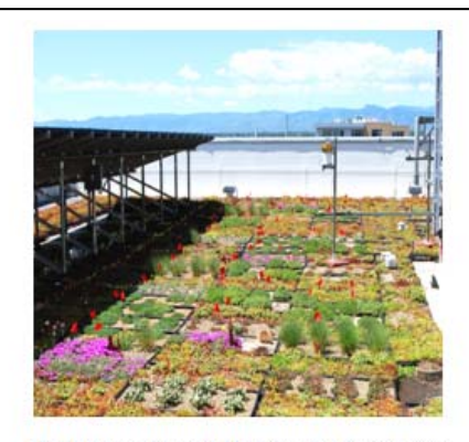
The EPA Region 8 Headquarters' green roof with study plots and instrumentation. The solar panels provide beneficial shade during hot weather.

Slabe, T. and O'Connor, T. 2011. DRAFT - Thermal Characteristics of an extensive green roof and a gravel ballasted roof in high elevation, semi-arid, temperate Denver, Colorado, U.S.A. EPA/R-600/XXX-08. December, 2011.