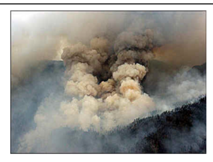
Smoke plume from the Hayman fire.

slope reseeding, and infrastructure projects as a result of the fire.