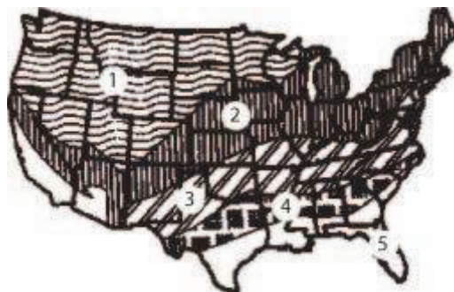
U.S.A. Crabgrass Seed Germination Dates

* NOTE: In many areas annual bluegrass exists as at least two biotypes or subspecies of Poa Annua . The true annual biotype, " Poa Annua spp.annua" which germinates from seed every year is controlled, while the biotype, " Poa Annua spp.raptans" which behaves like a perennial and survives through the summer, as an established plant, cannot be controlled. Consult the extension service or University weed specialist in your area for more information concerning your locale.