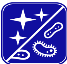
One-step cleaning and disinfection 1