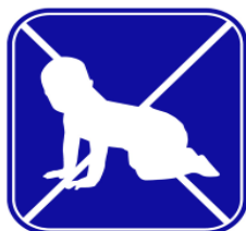
Not a baby wipe Not for personal use