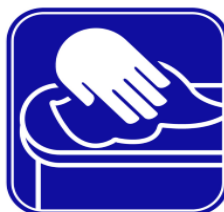
For hard, non-porous surfaces