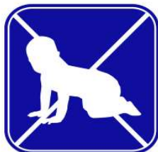
Not a baby wipe Not for personal use