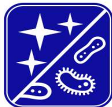
One-step cleaning and disinfection