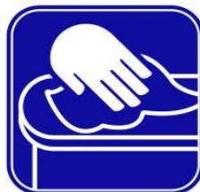
For hard, non-porous surfaces