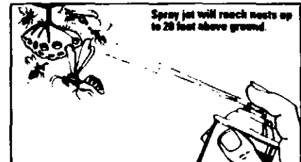
Spray jet will reach nests up to 20 feet above ground.

Superscript corresponds to first letter of lot number on bottom of can