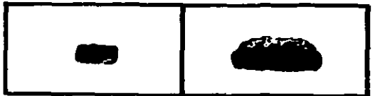
DRY, COMPRESSED PELLET WET, EXPANDED PELLET

The presence of snails and slugs can be detected by their sticky excrement trails. They are night feeders and prefer damp, cool places in the ornamental garden, flowers, under boards or flower pots and around fences, hedges and bushes.