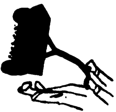
2-WHEEL SPREADER SETTINGS

Use setting No. 6 1/2. Apply 55 lbs. to cover 10,000 sq. ft. (100'x100'). Cover lawn in one direction. Do not use CRIS-CROSS pattern.